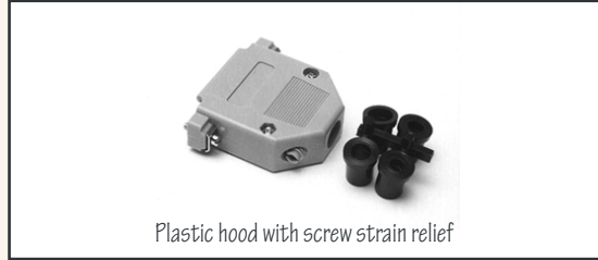
Plastic hood with screw strain relief