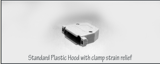
Standard Plastic Hood with clamp strain relief

D-SUB HOODS PLASTIC, METALIZED, HEAVY METAL