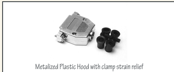
Metalized Plastic Hood with clamp strain relief